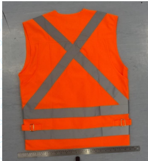
Vest: (front & reverse)